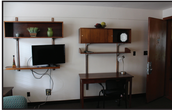
A television and retro work spaces rounds out the room.