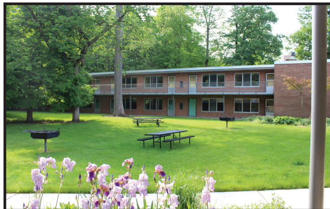
Van Hoosen Hall also features a fenced-in courtyard surrounded by gardens, picnic tables, and charcoal grills.