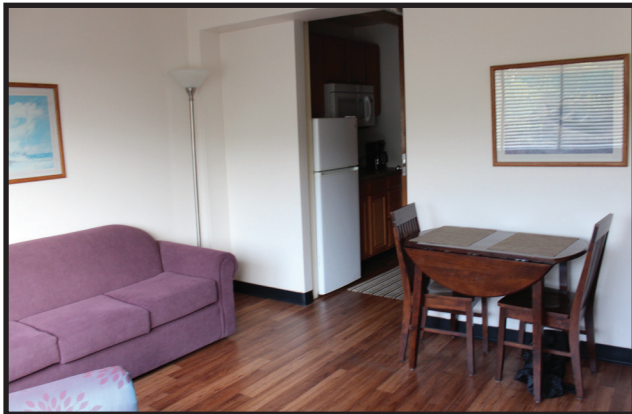
The living area has multiple seating and a small dining table for meals and workspace.