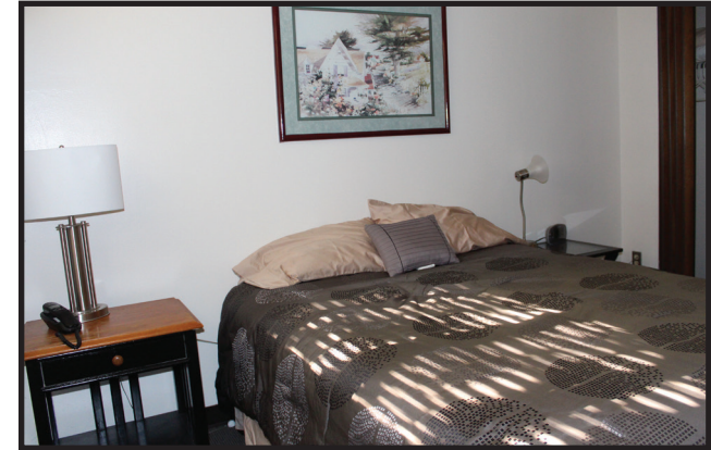
The bedroom features a queen bed, closet space, and a dresser for clothing storage.