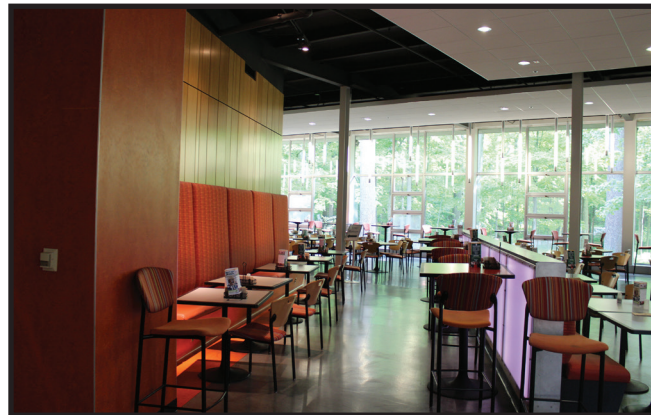
The Riverwalk Market and dining hall features many diverse culinary options.