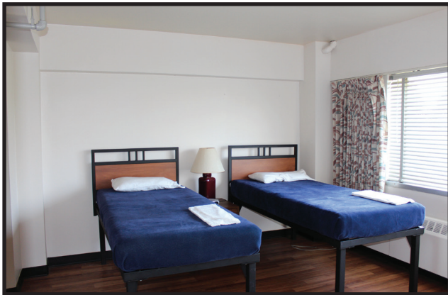
The bedroom features two twin beds, with closet space and a dresser for clothing storage, and an ironing board.