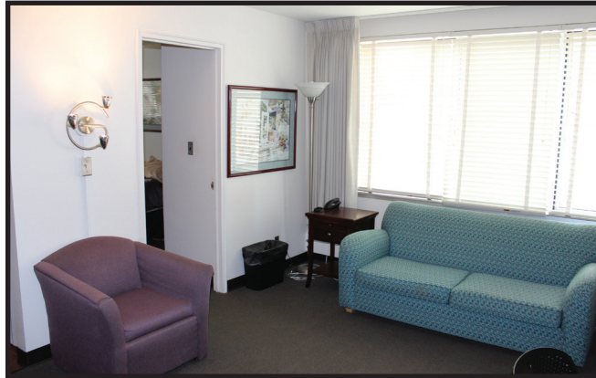
Spacious living area, featuring interior lighting and multiple seating.