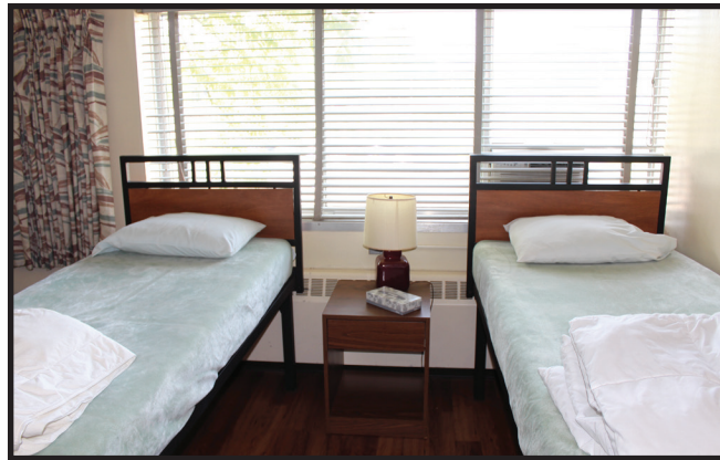
Along with two twin beds and closet space, there is also a small desk to hold personal items.