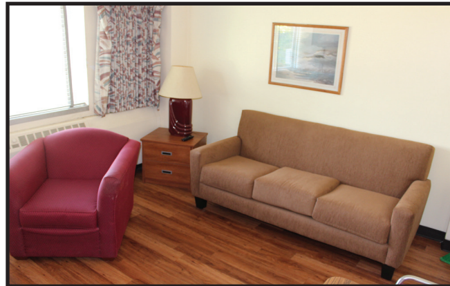
The living room has multiple seating and additional surfaces for meals and workspace.