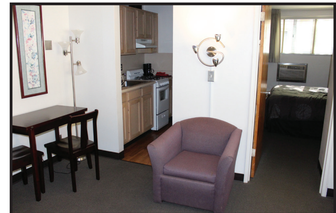
Desk space is also available to hold laptops and other personal items.